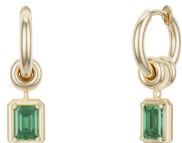
Zahra Emerald Cut YG Vert