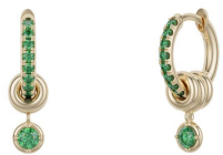
Zahra YG Emerald