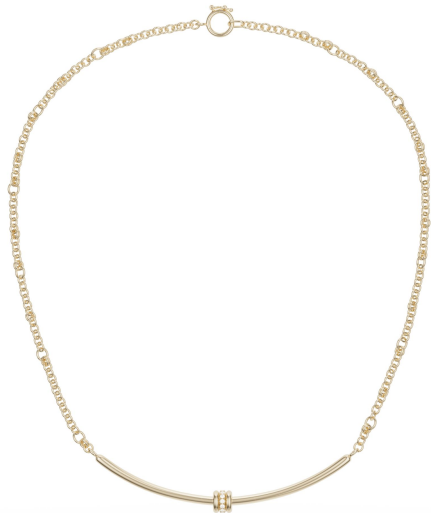
Gravity YG Pavé Arc

The Gravity Arc Necklace pairs our popular Gravity Chain in 18k yellow gold with a central bar that features three unfixed annulets for a tactile experience.