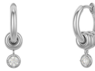
Zahra WG WD