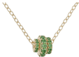
Vesta YG Emerald

Familiar SK styles interpreted in rich 18k yellow gold and resplendent emeralds.