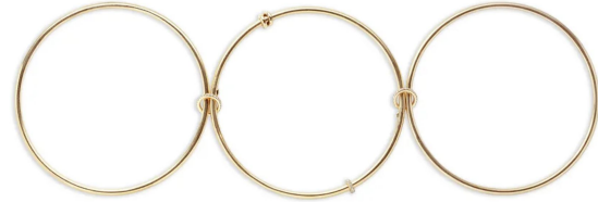
Chrysa YG Pavé Bangle

The Chrysa Bangle brings the signature SK linked design to wristwear, joining three 18k yellow gold bangles with pavé-set connectors. Three orbiting annulets complement the center band.