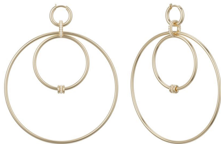
Echo YG Pavé