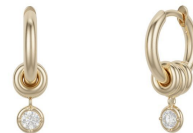
Zahra YG WD