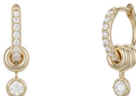
Zahra Pave YG WD