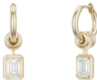
Zahra Emerald Cut YG WD

The Zahra Hoop Earrings display a streamlined silhouette and comfort closure in 18k gold. Three annulets adorn each hoop, the center of which bears a drop charm for added contrast and movement.