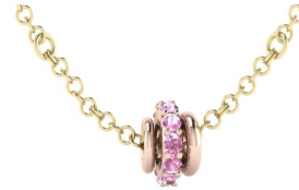
Gravity YG Pavé Rose