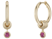
Zahra Max YG Pastel