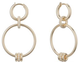
Asha YG Pavé

These earrings represent classic and bold takes on the classic hoop earring. Each lightweight silhouette features tactile annulets and can also be worn as a micro hoop and necklace charm.