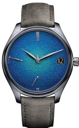
H. MOSER & CIE. Endeavour Perpetual Calendar