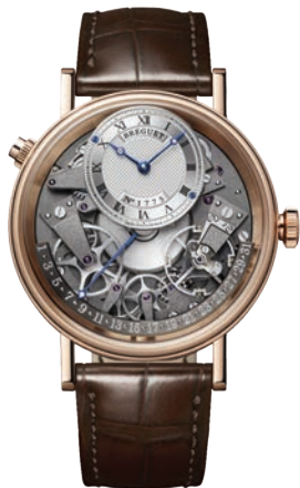
BREGUET Tradition Quantième Rétrograde 7597

Skeletonized watches are finely crafted works of art, revealing what usually remains hidden. Every element, however small, is beautifully staged to capture the movement of time in its purest form. The open construction allows time to be not just read but experienced.