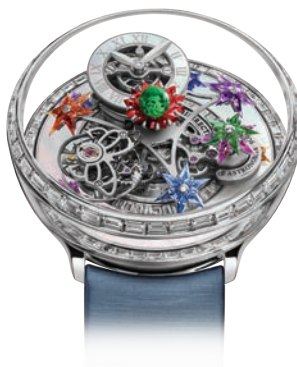
JACOB & CO Fleurs de Jardin