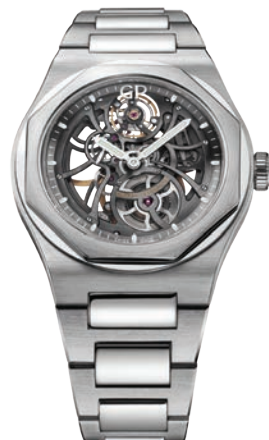
GIRARD-PERREGAUX Laureato Skeleton