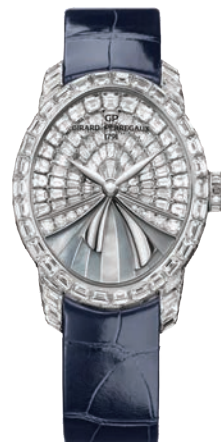
GIRARD-PERREGAUX Cat's Eye La Fenice