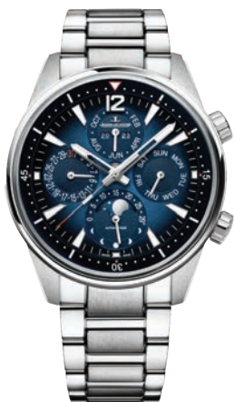
JAEGER-LECOULTRE Polar Perpetual Calendar

Perpetual calendars represent the perfect fusion of traditional watchmaking craftsmanship and modern precision. Their complex mechanisms record the hours, minutes, and seconds of the day in addition to the complex cycles of time: days, months, years, and even leap years. In their perfectly precise interplay of wheels and springs, they reveal the beauty and elegance of time itself.