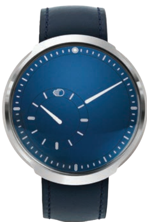
RESSENCE Type 8 Cobalt Blue

Some timepieces defy category, bringing an entirely new vision to the world of watchmaking. These pieces play with form and material to reinvent how we conceptualize time, resulting in unique and irreplaceable creations that aren't just timepieces but works of art.