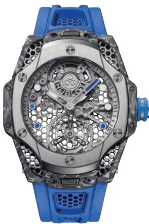
HUBLOT Big Bang Tourbillon

Tourbillons are unquestionably among the most sophisticated complications. Their blend of technical sophistication, enhanced accuracy, and aesthetic allure has captivated watch enthusiasts for over 200 years, making tourbillon watches highly coveted marvels of technology.