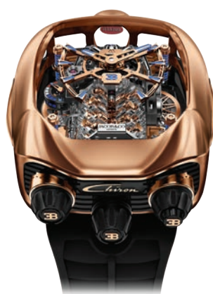
JACOB & CO Bugatti Chiron Tourbillon