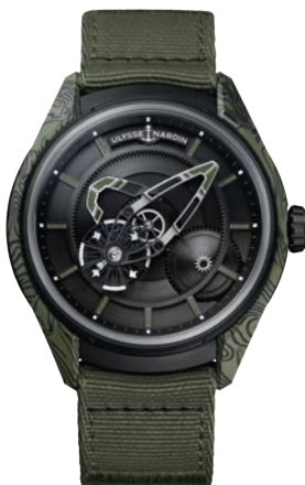
ULYSSE NARDIN Freak X OPS