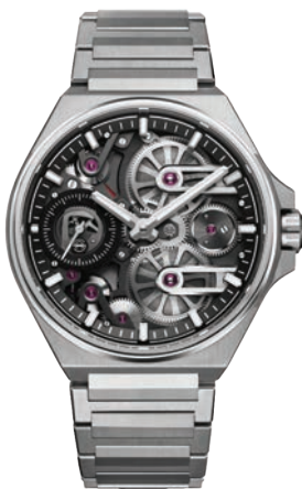
ARMIN STROM One Week