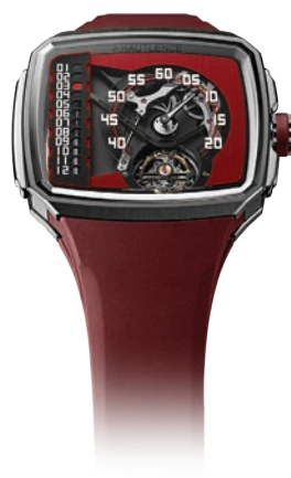
HAUTLENCE Linear Series 3