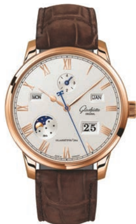
GLASHÜTTE ORIGINAL Senator Excellence Perpetual Calendar