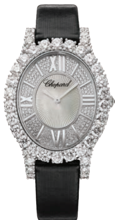
CHOPARD L'Heure du Diamant

Precision, creativity, and dexterity elevate gem setting to the highest discipline in watch refinement. Skilled artisans meticulously place gemstones and diamonds in the case and dial to create sparkling works of art with inimitable radiance.