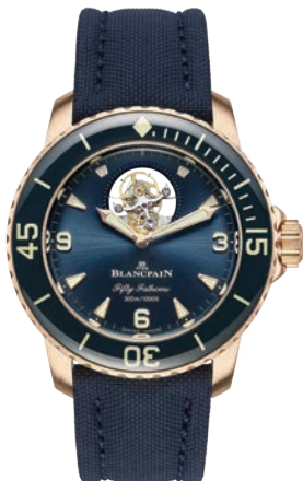
BLANCPAIN Fifty Fathoms Tourbillon 8 Jours