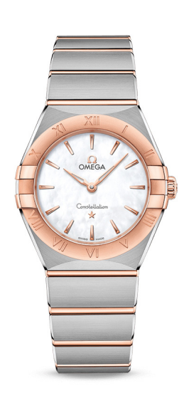
H. CONSTELLATION MANHATTAN 28mm Stainless steel case with steel and Sedna™ gold bracelet. White MOP dial. Quartz. $5,100