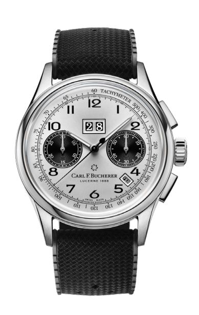
A. HERITAGE BICOMPAX ANNUAL 41mm Stainless steel case with black rubber strap. Silver dial. Automatic. $7,200