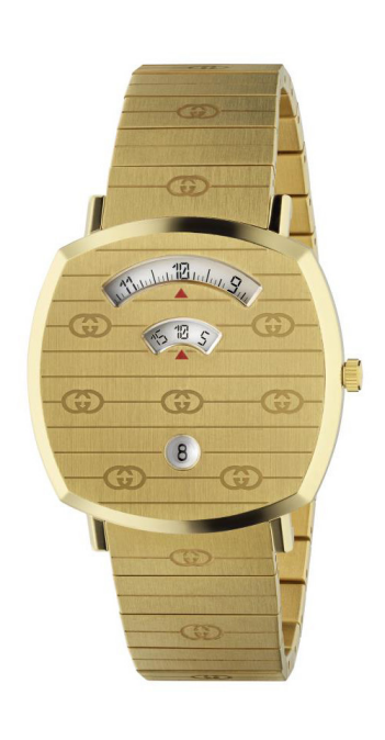
A. GRIP 38 38mm Yellow gold PVD case and bracelet. 3 windows indicating hour, minute and date. Quartz. $1,900