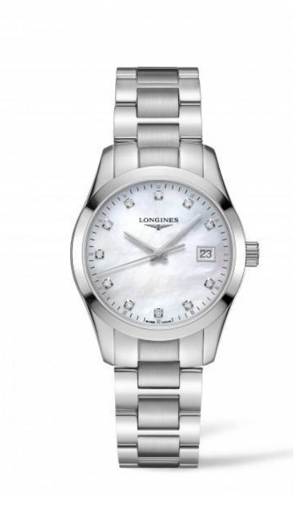
D. CONQUEST CLASSIC 34mm Stainless steel case and bracelet. MOP diamond dial. Quartz. $1,350