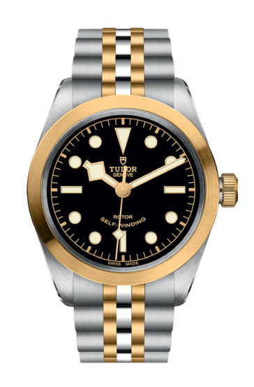
N. BLACK BAY 36mm Stainless steel case with steel and yellow gold bracelet. Black dial. Automatic. $4,100