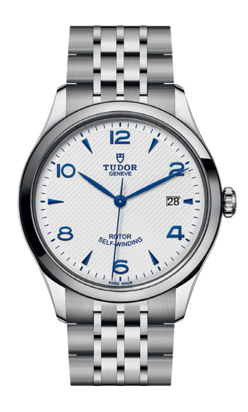
F. 1926 39mm Stainless steel case and bracelet. Opaline dial. Automatic. $1,900