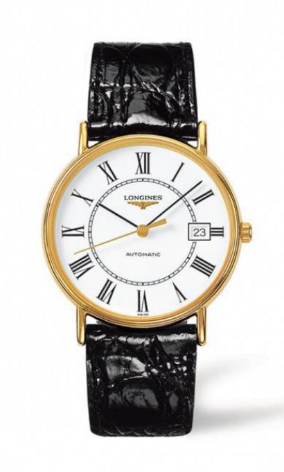
B. PRESENCE 38mm Stainless steel and yellow PVD coating case with black leather strap. White dial. Automatic. $1,300