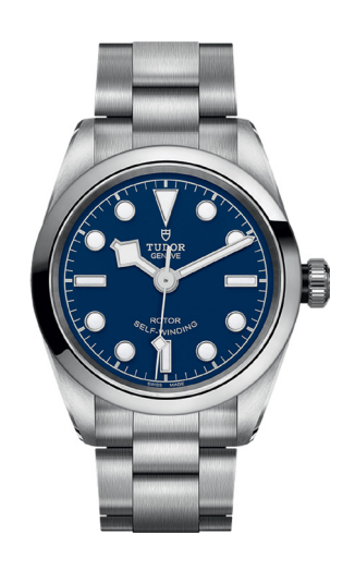
C. BLACK BAY 32mm Stainless steel case and bracelet. Blue dial. Automatic. $2,850