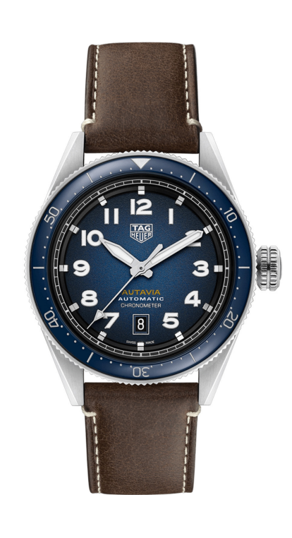
L. AUTAVIA 42mm Stainless steel case with brown leather strap. Blue dial. Automatic. $3,100