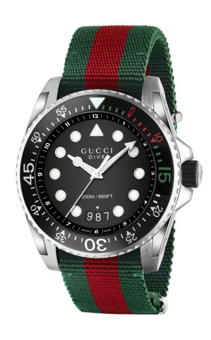
B. DIVE XL 45mm Stainless steel case with green/red/green web nylon strap. Black dial. Quartz. $1,380