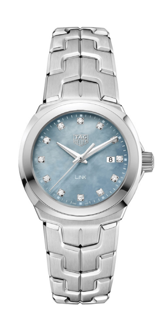
J. LADY LINK 32mm Stainless steel case and bracelet. Grey MOP diamond dial. Quartz. $2,350