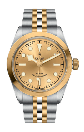
O. BLACK BAY 36mm Stainless steel case with steel and yellow gold bracelet. Champagne dial. Automatic. $4,100