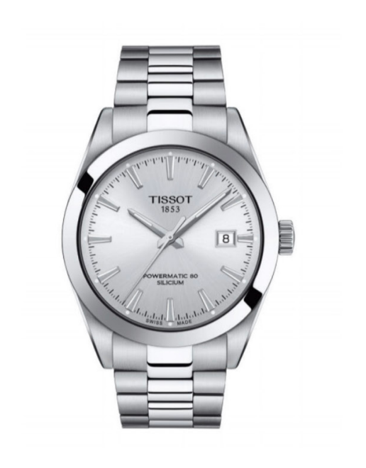
B. GENTLEMAN POWERMATIC 40mm Stainless steel case and bracelet. Silver dial. Automatic. $775