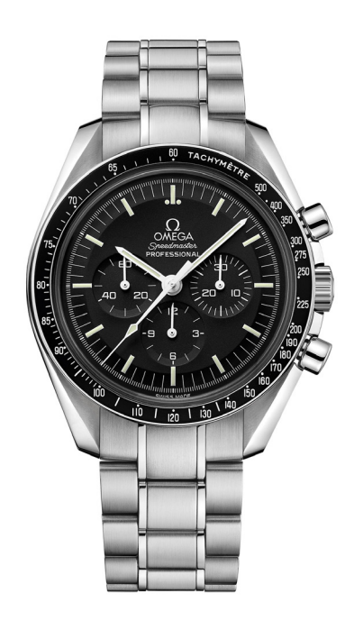
C. SPEEDMASTER MOONWATCH PROFESSIONAL 42mm Stainless steel case and bracelet. Black dial. Automatic. $5,350