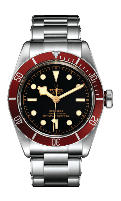
K. BLACK BAY 41mm Stainless steel case and bracelet. Black dial. Automatic. $3,800