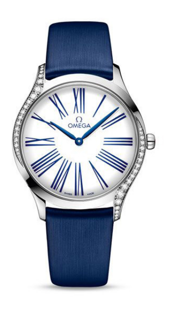
G. DE VILLE TRÉSOR 36mm Stainless steel case and blue fabric strap. White dial. Quartz. $4,500