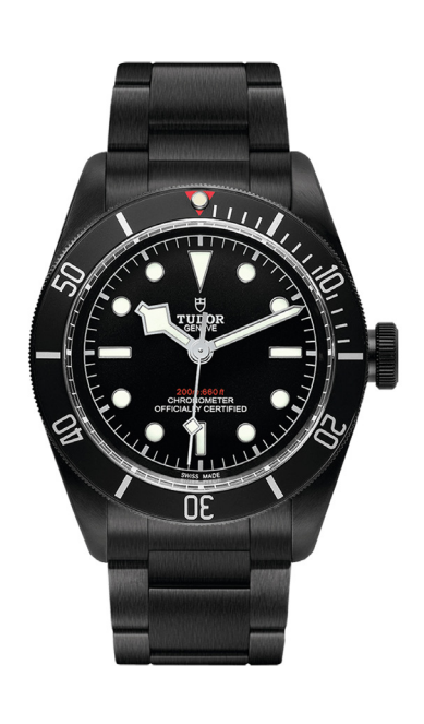
L. BLACK BAY 41mm Stainless steel black PVD case and bracelet. Black dial. Automatic. $4,625