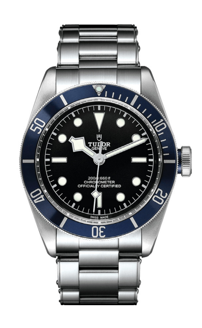
J. BLACK BAY 41mm Stainless steel case and bracelet. Black dial. Automatic. $3,800