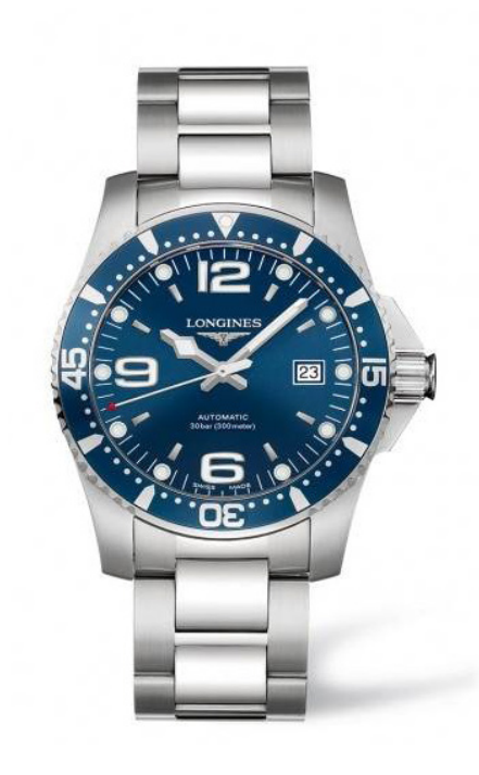
A. HYDROCONQUEST 41mm Stainless steel case and bracelet. Blue dial. Automatic. $1,275