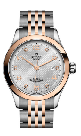
H. 1926 28mm Stainless steel case with steel and rose gold bracelet. Silver diamond dial. Automatic. $3,375