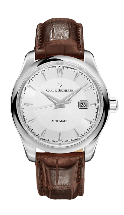
D. MANERO AUTODATE 43mm Stainless steel case with brown alligator strap. Silver dial. Automatic. $3,400