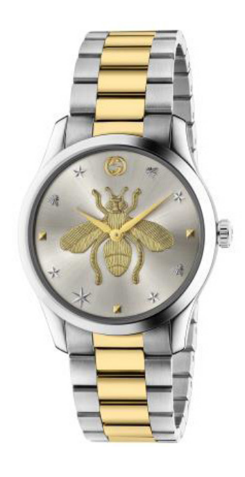
C. G-TIMELESS ICONIC 38mm Stainless steel case with steel and yellow gold PVD bracelet. Silver dial. Quartz. $1,150