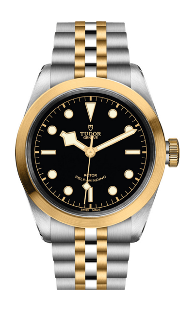
M. BLACK BAY 41mm Stainless steel case with steel and yellow gold bracelet. Black dial. Automatic. $4,200