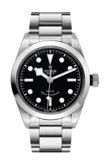
B. BLACK BAY 36mm Stainless steel case and bracelet. Black dial. Automatic. $2,950