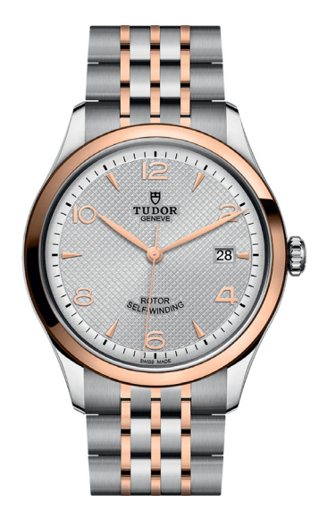
G. 1926 39mm Stainless steel case with steel and rose gold and bracelet. Silver dial. Automatic. $2,950