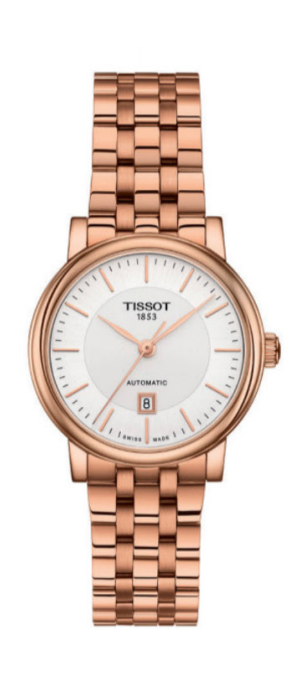
CARSON PREMIUM LADY 30mm Stainless steel case and bracelet with rose gold PVD coating. Silver dial. Automatic. $775