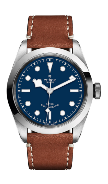
D. BLACK BAY 41mm Stainless steel case with brown leather strap. Blue dial. Automatic. $2,725