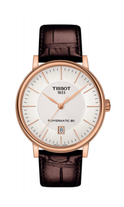
C. CARSON POWERMATIC 40mm Stainless steel case with rose gold PVD coating and brown leather strap. Silver dial. Automatic. $695