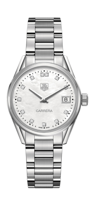
K. CARRRERA 32mm Stainless steel case and bracelet. White MOP diamond dial. Automatic. $2,300