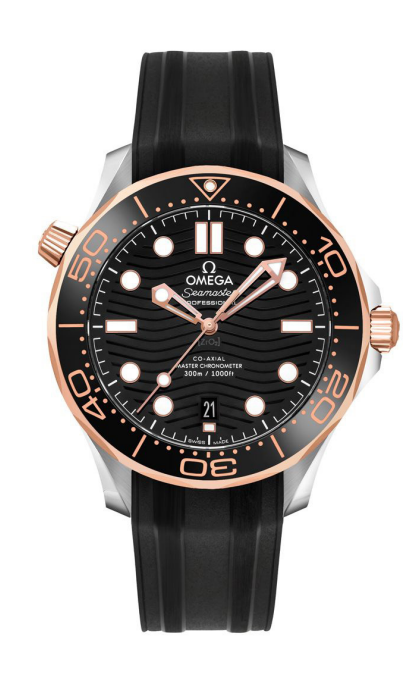
D. SEAMASTER DIVER 300M 42mm Stainless steel case with black rubber strap. Black dial. Automatic. $6,900