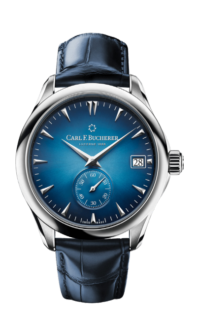
C. MANERO PERIPHERAL 41mm Stainless steel case with blue alligator strap. Blue dial. Automatic. $6,800