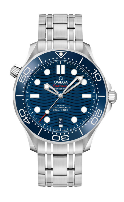
B. SEAMASTER DIVER 300M 42mm Stainless steel case and bracelet. Blue dial. Automatic. $5,200