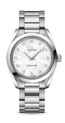
F. SEAMASTER AQUA TERRA 28mm Stainless steel case and bracelet. White MOP diamond dial. Quartz. $3,700