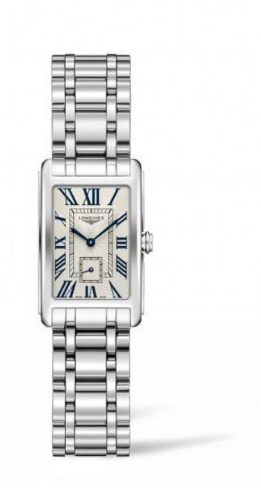
C. DOLCEVITA 20mm Stainless steel case and bracelet. Silver dial. Quartz. $1,250