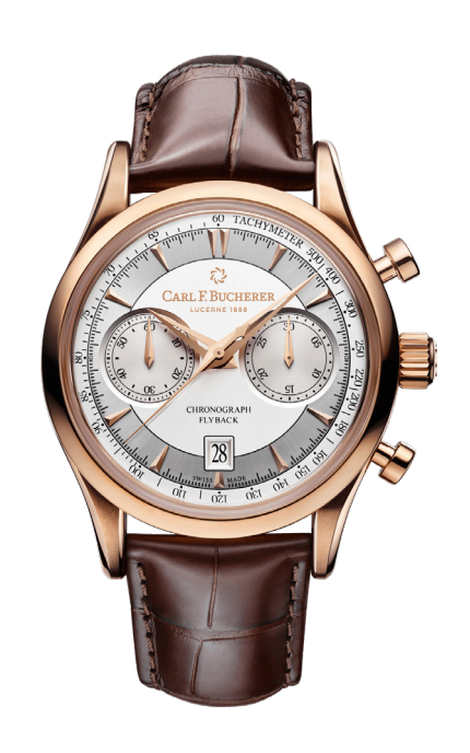
B. MANERO FLYBACK 43mm Rose gold case with brown alligator strap. Silver dial. Automatic. $16,900