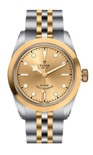
P. BLACK BAY 32mm Stainless steel case with steel and yellow gold bracelet. Champagne dial. Automatic. $4,000