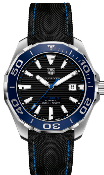
K. AQUARACER 43mm Stainless steel case with black nylon strap, Black dial. Automatic.