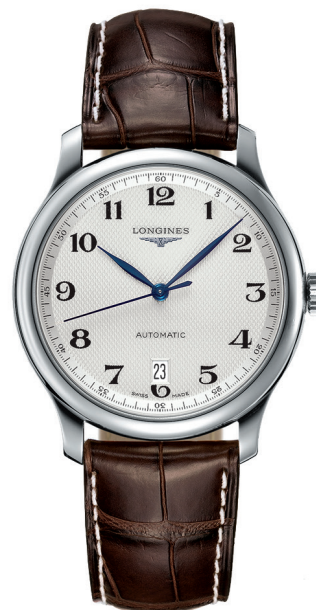
C. MASTER COLLECTION 38.5mm Stainless steel case with brown alligator strap, Silver Arabic dial. Automatic.