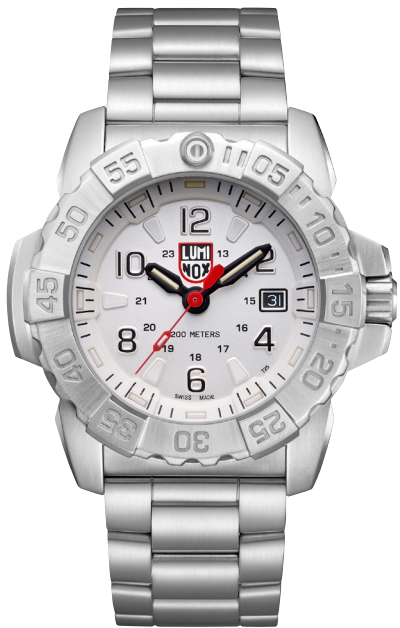
A. NAVY SEAL 45mm Stainless steel case and bracelet, Silver dial. Quartz.