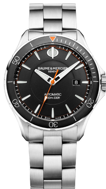
G. CLIFTON CLUB 42mm Stainless steel case and bracelet. Black dial. Automatic.