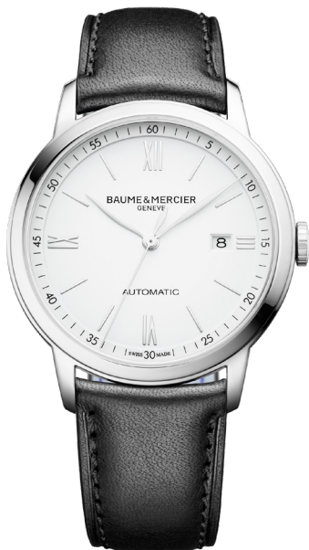
A. CLASSIMA 42mm Stainless steel case with black calf strap. White dial. Automatic.