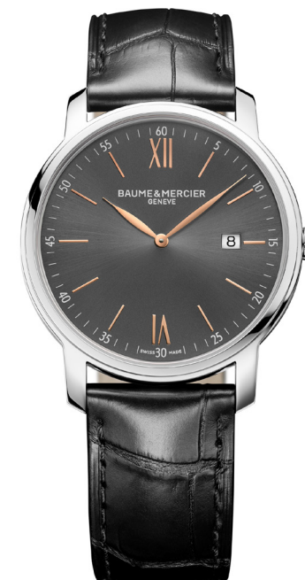
D. MY CLASSIMA 42mm Stainless steel case, black leather strap with alligator pattern. Slate gray dial. Quartz.