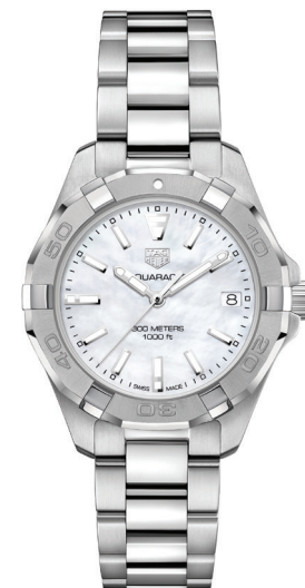
L. AQUARACER 32mm Stainless steel case and bracelet, White MOP dial. Quartz.