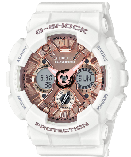
D. G-SHOCK S 49mm all white resin case and strap, Rose gold color dial. World time.