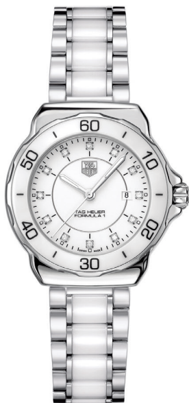
F. FORMULA ONE CERAMIC 32mm Stainless steel and ceramic case and bracelet, White diamond dial. Quartz.