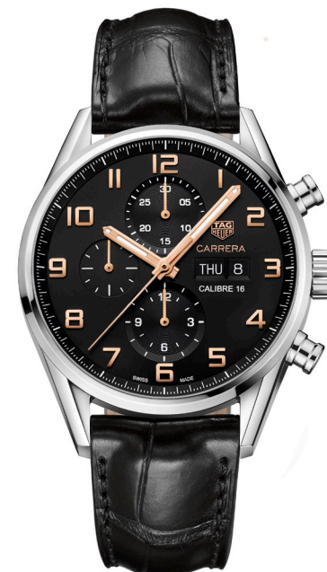
D. CARRERA 43mm Stainless steel case with black alligator strap, Black chronograph dial. Automatic.