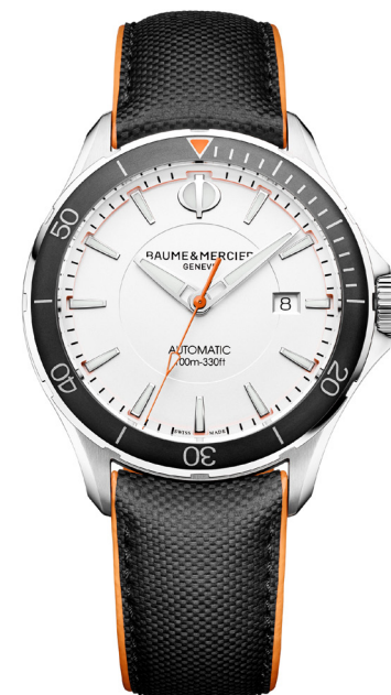
H. CLIFTON CLUB 42mm Stainless steel case with black calfskin strap. White dial. Automatic.