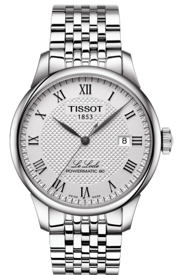
D. LE LOCLE 39mm Stainless steel case and bracelet. Silver dial. Automatic.