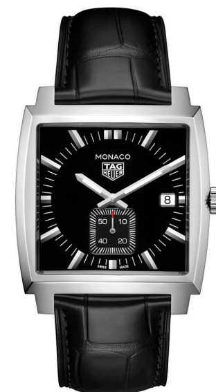
H. MONACO 37mm Stainless steel case with black alligator strap, Black dial. Quartz.