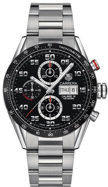
A. CARRERA 43mm Stainless steel case and bracelet, Black chronograph dial. Automatic.