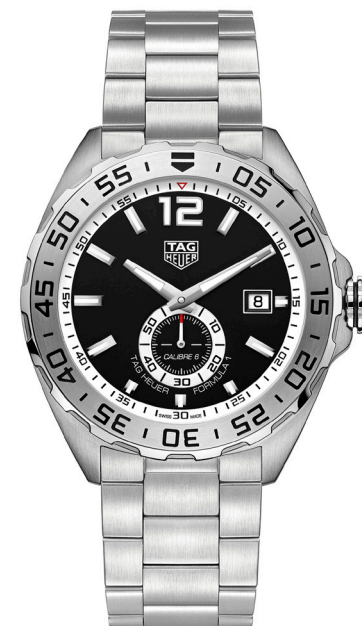
P. FORMULA ONE 43mm Stainless steel case and bracelet, Black dial. Automatic.