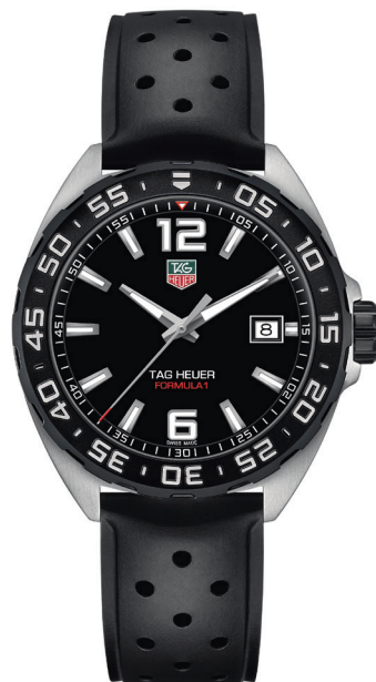
O. FORMULA ONE 41mm Stainless steel case with black rubber strap, Black dial. Quartz.