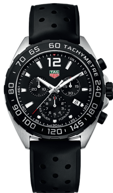
C. FORMULA ONE 43mm Stainless steel case with black rubber strap, Black chronograph dial. Quartz.