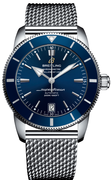
A. SUPEROCEAN HÉRITAGE II 46 46mm Stainless steel case and bracelet, Blue dial. Automatic.