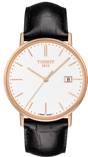
G. GOLDRUN 38mm 18K Rose gold case with black leather strap, White dial. Quartz.