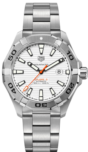
I. AQUARACER 43mm Stainless steel case and bracelet, White dial. Automatic.