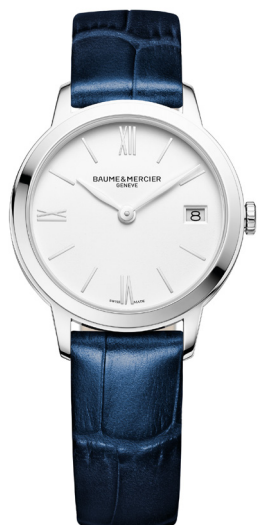
E. MY CLASSIMA 31mm Stainless steel case, blue leather strap with alligator pattern. White Dial. Quartz.