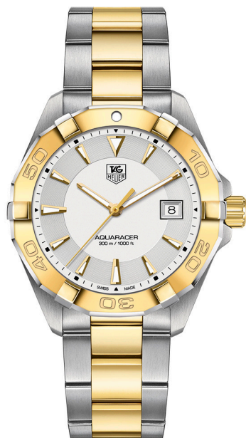
J. AQUARACER 40.5mm Stainless steel and gold PVD case and bracelet, Silver dial. Quartz.