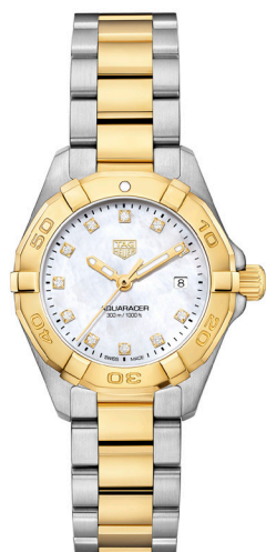
M. AQUARACER 27mm Stainless steel and gold PVD case and bracelet, White MOP diamond dial. Quartz.