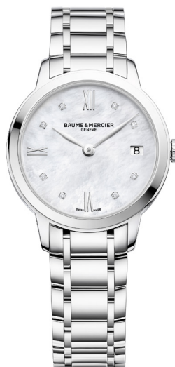
B. CLASSIMA 31mm Stainless steel case and bracelet. MOP diamond dial. Quartz.