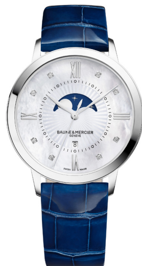
C. CLASSIMA MOONPHASE 36.5mm Stainless steel case with blue alligator strap. MOP diamond dial. Quartz.