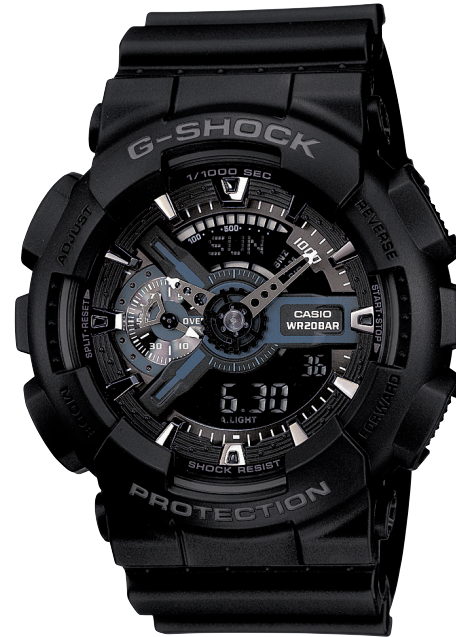
C. G-SHOCK 55mm all black resin case and strap, Black dial. World time.