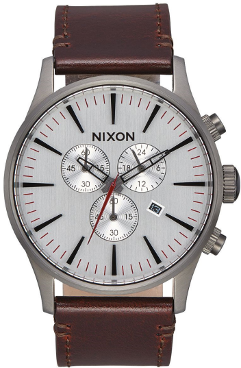
A. SENTRY CHRONO LEATHER 42mm Gunmetal case with dark brown leather strap, Silver chronograph dial. Quartz.