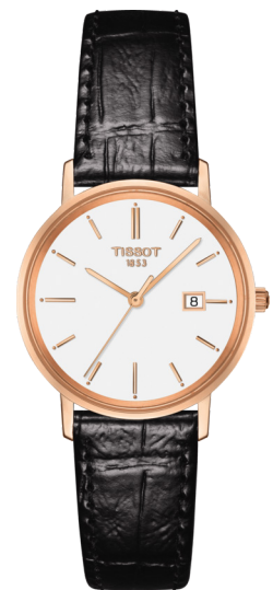
H. GOLDRUN 29mm 18K Rose gold case with black leather strap, White dial. Quartz.