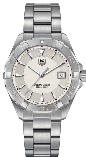
G. AQUARACER 40.5mm Stainless steel case and bracelet, Silver dial. Quartz.