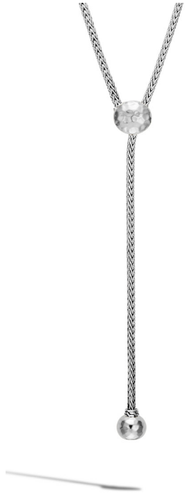
A. CLASSIC CHAIN HAMMERED DROP NECKLACE IN SILVER Sterling silver Y-shaped necklace. 32" length.