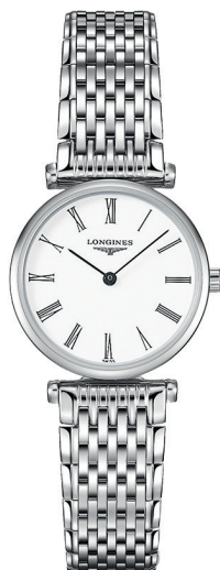
B. LA GRANDE CLASSIQUE 24mm Stainless steel case and bracelet, White Roman dial. Quartz.