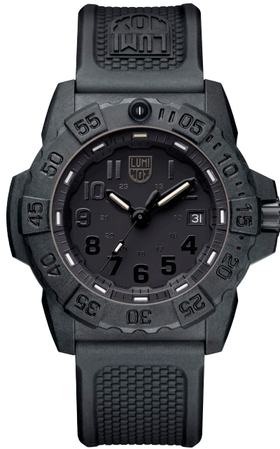
B. NAVY SEAL 45mm all black case with rubber strap, Black dial. Quartz.