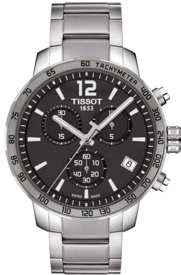
F. QUICKSTER 42mm Stainless steel case and bracelet. Black chronograph dial. Quartz.