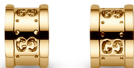
B. ICON TWIRL EARRINGS 18K Yellow gold.