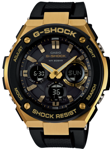
B. G-STEEL 59mm Gold plated case with black strap, Black chronograph dial. Solar powered World time.