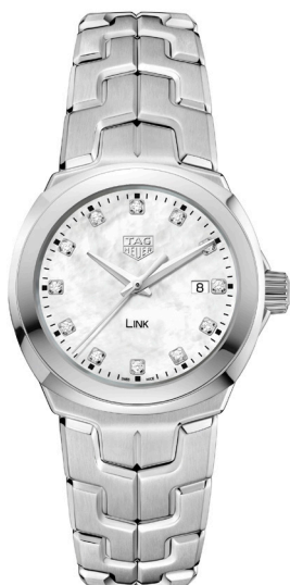
N. LINK 32mm Stainless steel case and bracelet, White MOP diamond dial. Quartz.