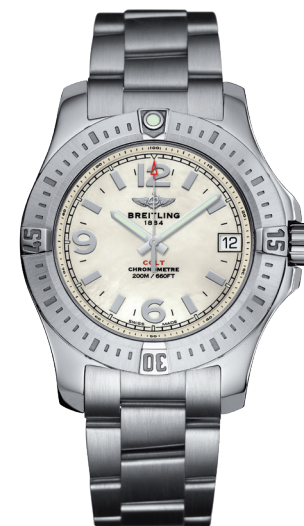
D. COLT 36 36mm Stainless steel case and bracelet, MOP dial. SuperQuartz™.