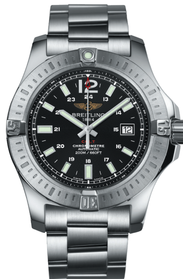
C. COLT AUTOMATIC 44mm Stainless steel case and bracelet, Black dial. Automatic.