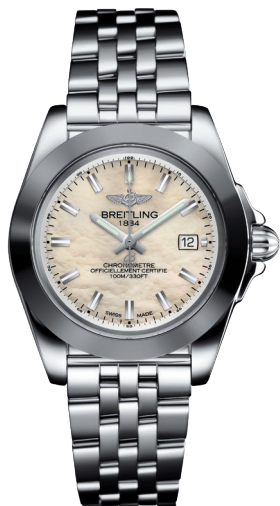
B. GALACTIC 32 SLEEK EDITION 32mm Stainless steel case and bracelet, MOP dial. Quartz.