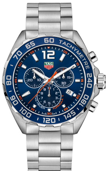
B. FORMULA ONE 43mm Stainless steel case and bracelet, Blue chronograph dial. Quartz.