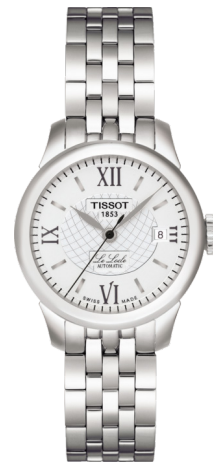
C. LE LOCLE 25mm Stainless steel case and bracelet. Silver dial. Automatic.