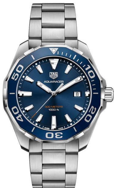
E. AQUARACER 43mm Stainless steel case and bracelet, Blue dial. Quartz.