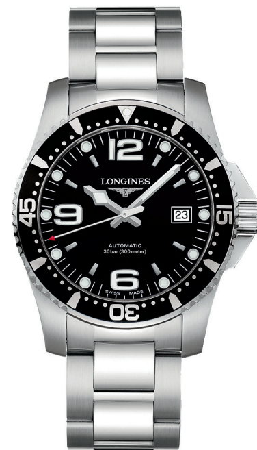
D. HYDROCONQUEST 44mm Stainless steel case and bracelet, Black dial. Automatic.