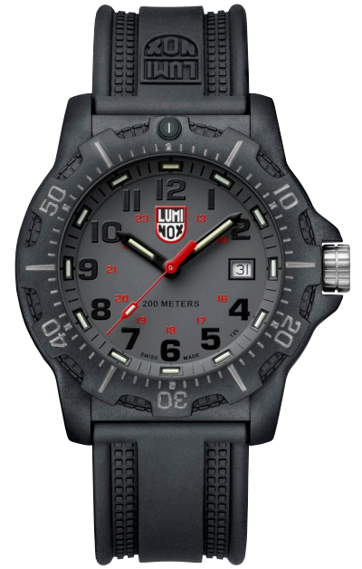
D. BLACK OPS 45mm all black case with rubber strap, Gray dial. Quartz.