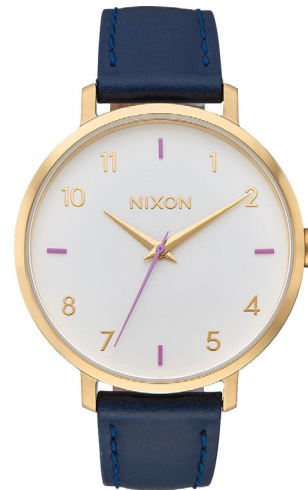
C. ARROW LEATHER 38mm Gold plated case with navy leather strap, White dial. Quartz.