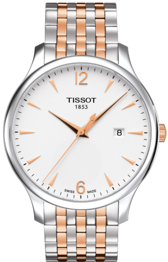
A. TRADITION 42mm Stainless steel case with steel and Rose PVD bracelet. White dial. Quartz.