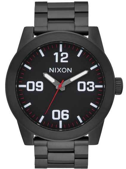
D. CORPORAL SS 48mm all black case and bracelet, Black dial. Quartz.