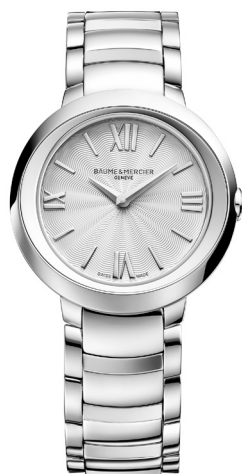
F. PROMESSE 30mm Stainless steel case and bracelet. Silver guilloché dial. Quartz.