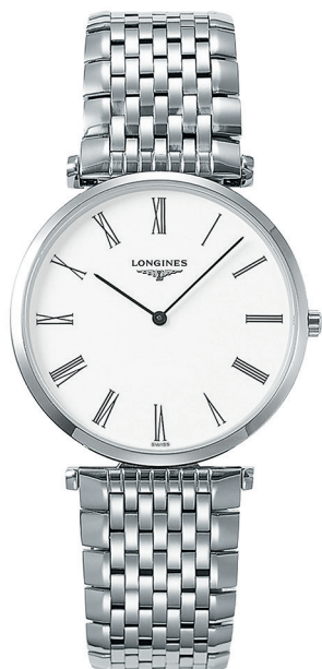
A. LA GRANDE CLASSIQUE 36mm Stainless steel case and bracelet, White Roman dial. Quartz.