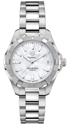
L. AQUARACER 32mm Stainless steel case and bracelet, White MOP dial. Quartz.