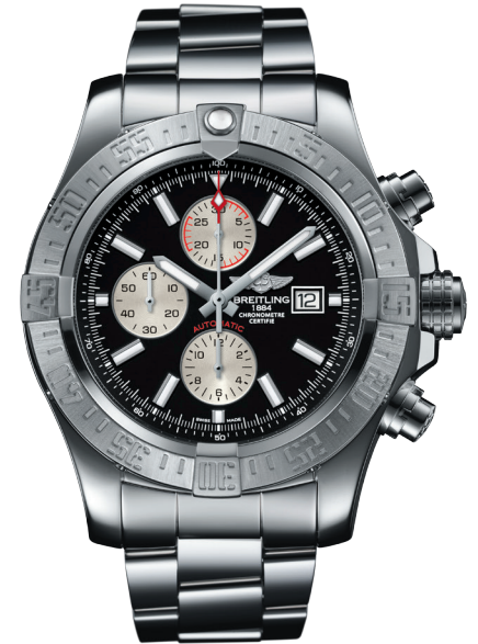
H. SUPER AVENGER II 48mm Stainless steel case and bracelet, Black chronograph dial. Automatic.