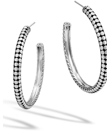
C. DOT SMALL HOOP EARRING IN SILVER Sterling silver small hoop earrings with post back.