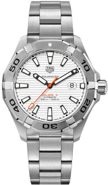
I. AQUARACER 43mm Stainless steel case and bracelet, White dial. Automatic.