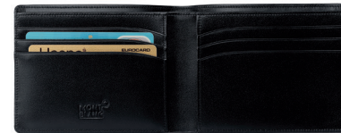
H. MEISTERSTUCK 6CC WALLET Black European full-grain cowhide leather with 2 bill compartments and 2 additional pockets.