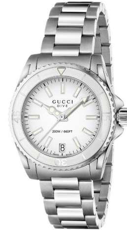
H. GUCCI DIVE 32mm stainless steel case and bracelet with white lacquered dial.