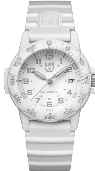
C. SEA TURTLE 39mm all white case with rubber strap, White dial. Quartz.