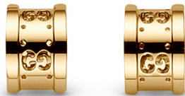
B. ICON TWIRL EARRINGS 18K Yellow gold.