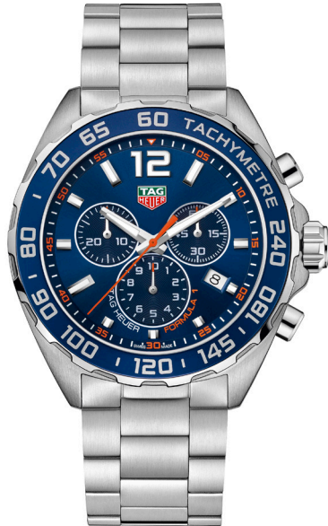
B. FORMULA ONE 43mm Stainless steel case and bracelet, Blue chronograph dial. Quartz.