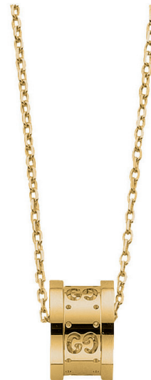
C. ICON TWIRL NECKLACE 18K Yellow gold.