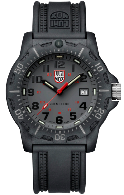
D. BLACK OPS 45mm all black case with rubber strap, Gray dial. Quartz.