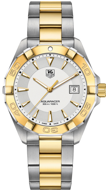
J. AQUARACER 40.5mm Stainless steel and gold PVD case and bracelet, Silver dial. Quartz.