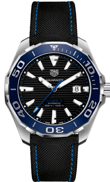
K. AQUARACER 43mm Stainless steel case with black nylon strap, Black dial. Automatic.