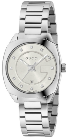
F. GG2570 29mm stainless steel case and bracelet with white sun-brushed dial with diamonds.