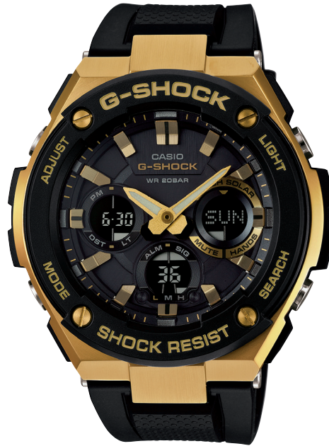
B. G-STEEL 59mm Gold plated case with black strap, Black chronograph dial. Solar powered World time.