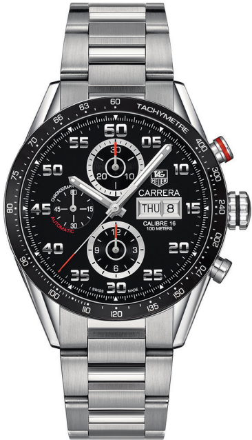
A. CARRERA 43mm Stainless steel case and bracelet, Black chronograph dial. Automatic.