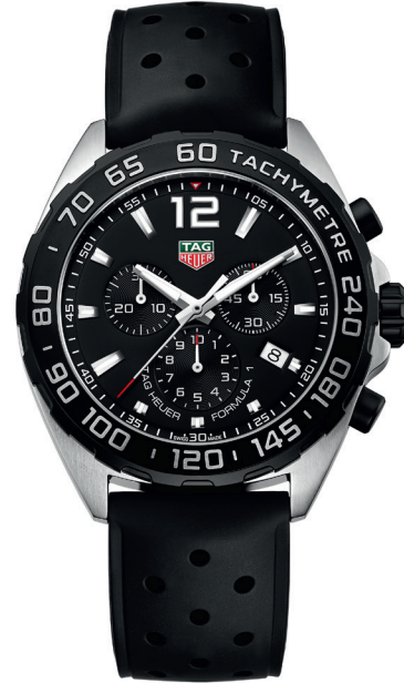
C. FORMULA ONE 43mm Stainless steel case with black rubber strap, Black chronograph dial. Quartz.