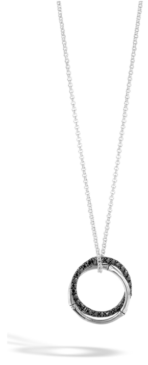
E. BAMBOO INTERLINKING PENDANT NECKLACE WITH BLACK SAPPHIRE IN SILVER Sterling silver medium interlink pendant on rolo chain with black sapphires. Adjustable 16"-18".