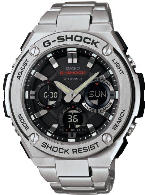
A. G-STEEL 59mm Stainless steel case and bracelet, Black chronograph dial. Solar powered World time.