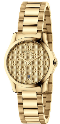
I. G-TIMELESS 27mm yellow gold PVD case and bracelet with yellow gold diamond pattern dial.