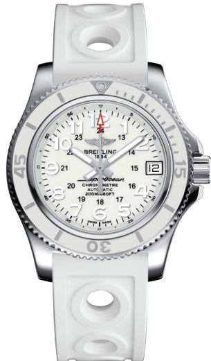
F. SUPEROCEAN II 36 36mm Stainless steel case with Ocean Racer II rubber strap White dial. Automatic.