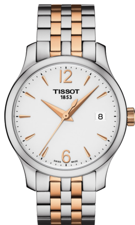
B. TRADITION 33mm Stainless steel case with steel and Rose PVD bracelet. White dial. Quartz.