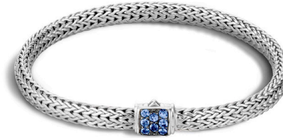
D. CLASSIC CHAIN BRACELET WITH BLUE SAPPHIRE IN SILVER Sterling silver chain bracelet with blue sapphire clasp.