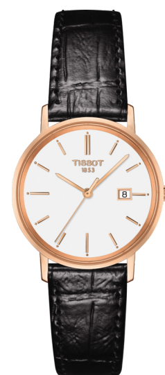
H. GOLDRUN 29mm 18K Rose gold case with black leather strap, White dial. Quartz.