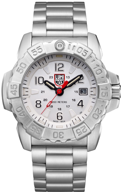
A. NAVY SEAL 45mm Stainless steel case and bracelet, Silver dial. Quartz.