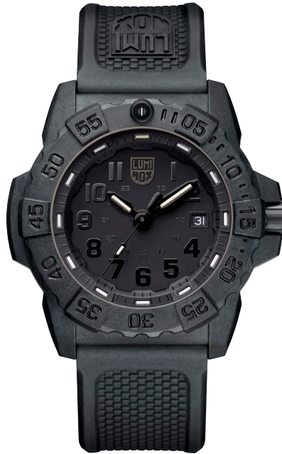
B. NAVY SEAL 45mm all black case with rubber strap, Black dial. Quartz.