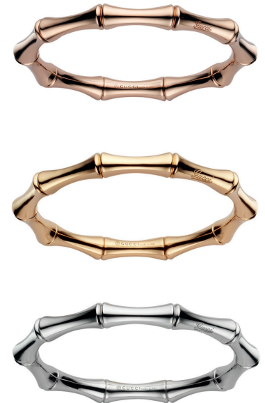
D. BAMBOO BRACELET Medium bracelet in 18K Pink gold, Yellow gold or White gold with spring mechanism.