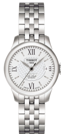
C. LE LOCLE 25mm Stainless steel case and bracelet. Silver dial. Automatic.