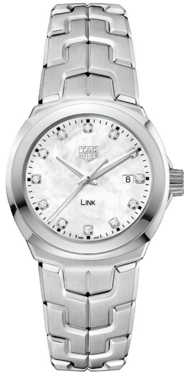
N. LINK 32mm Stainless steel case and bracelet, White MOP diamond dial. Quartz.