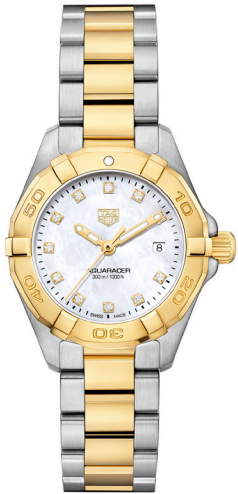
M. AQUARACER 27mm Stainless steel and gold PVD case and bracelet, White MOP diamond dial. Quartz.