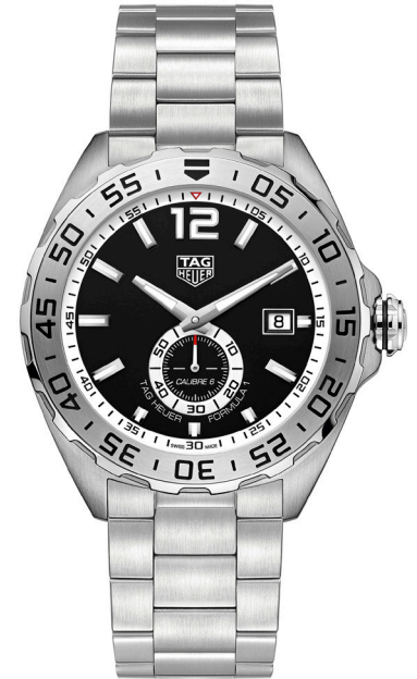
P. FORMULA ONE 43mm Stainless steel case and bracelet, Black dial. Automatic.