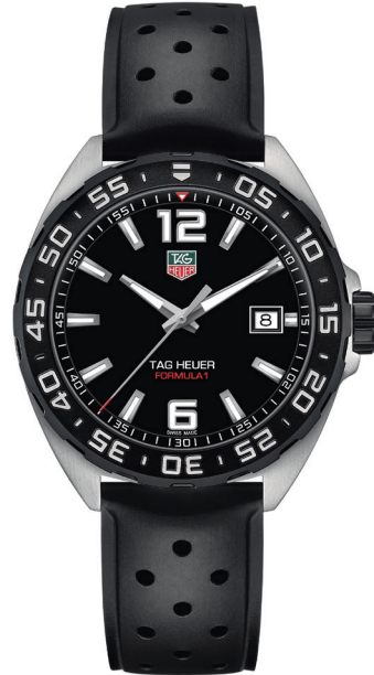
O. FORMULA ONE 41mm Stainless steel case with black rubber strap, Black dial. Quartz.