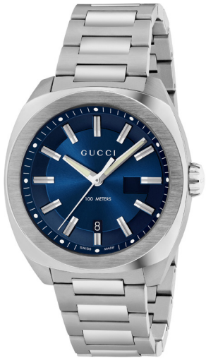
E. GG2570 44mm stainless steel case and bracelet with dark blue sun-brushed dial.