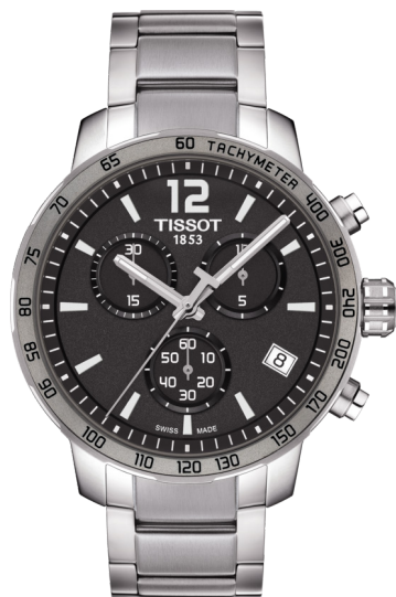
F. QUICKSTER 42mm Stainless steel case and bracelet. Black chronograph dial. Quartz.