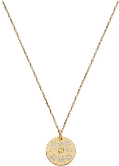
A. ICON BLOOMS NECKLACE 18K Yellow gold and White enamel.