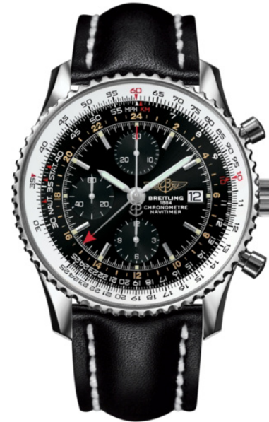
G. NAVITIMER WORLD 46mm Stainless steel case with black leather strap, Black chronograph dial. Automatic.