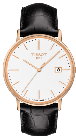
G. GOLDRUN 38mm 18K Rose gold case with black leather strap, White dial. Quartz.