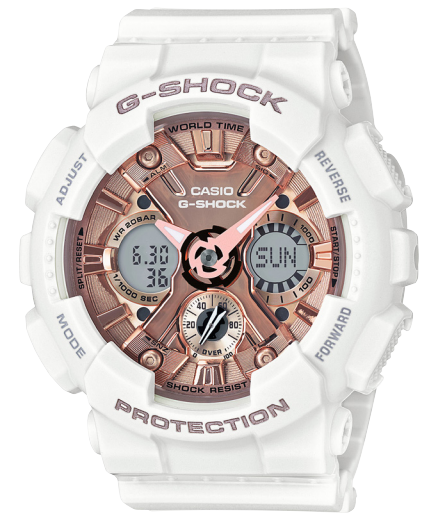
D. G-SHOCK S 49mm all white resin case and strap, Rose gold color dial. World time.