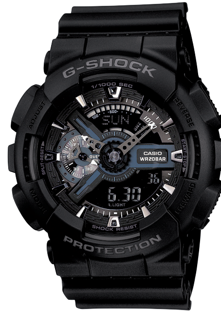
C. G-SHOCK 55mm all black resin case and strap, Black dial. World time.