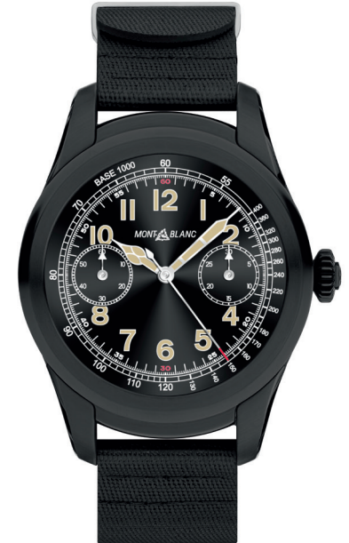
I. SUMMIT SMARTWATCH 46mm Black PVD steel case with black rubber strap, Black dial.