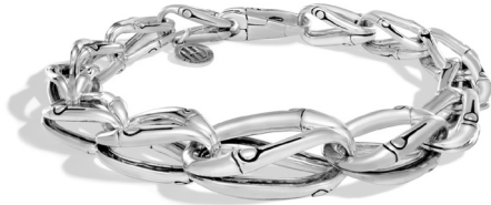
B. BAMBOO GRADUATED LINK BRACELET IN SILVER Sterling silver graduated link bracelet with lobster clasp.