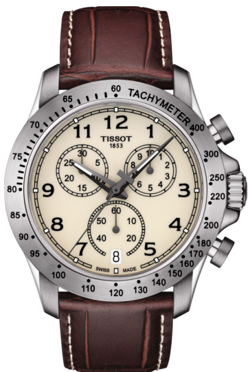
E. V8 42.5mm Stainless steel case with brown leather strap. Ivory chronograph dial. Quartz.