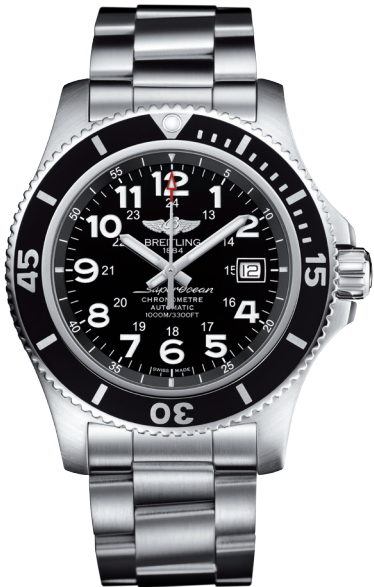
E. SUPEROCEAN II 44 44mm Stainless steel case and bracelet, Black dial. Automatic.