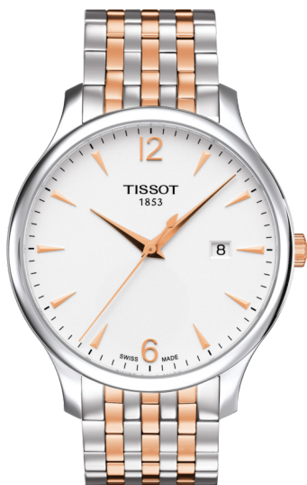
A. TRADITION 42mm Stainless steel case with steel and Rose PVD bracelet. White dial. Quartz.