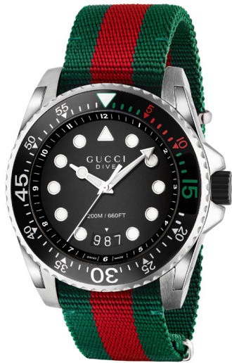
G. GUCCI DIVE 45mm stainless steel case with green/red/green web nylon strap and black matte dial.