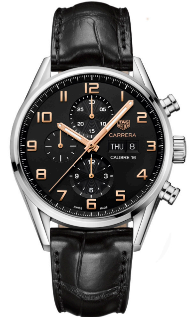
D. CARRERA 43mm Stainless steel case with black alligator strap, Black chronograph dial. Automatic.